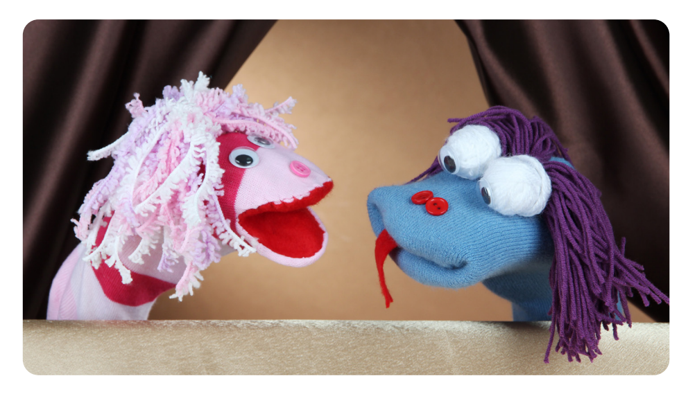
A puppet is a movable model of a person or animal.

Read these interesting facts about puppets and pop ups with a parent, carer or teacher.