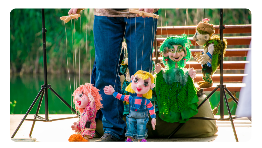
There are lots of different types of puppets, such as hand puppets and string puppets. String puppets are also called marionettes.

Puppets are moved by strings, rods or by a hand. The person who works a puppet is called a puppeteer.