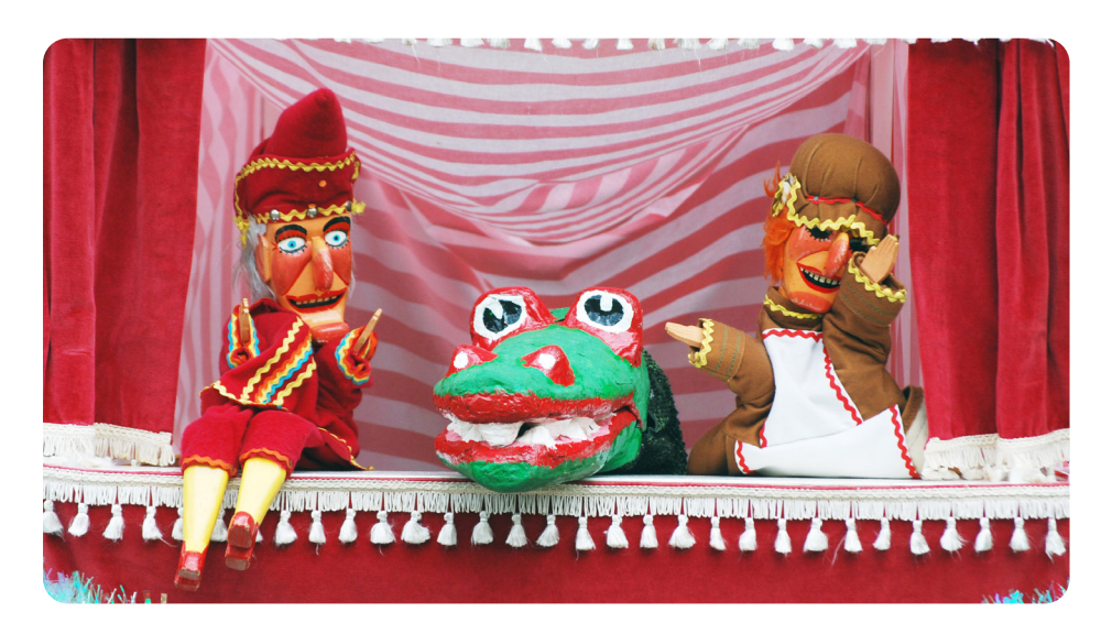
Puppets have been used to tell stories all over the world for thousands of years.