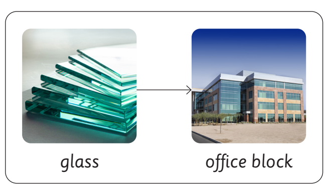
The walls of this office block are made from glass.

A material is what an object is made from. These shelters are made from different materials.