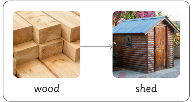
This shed is made from wood.