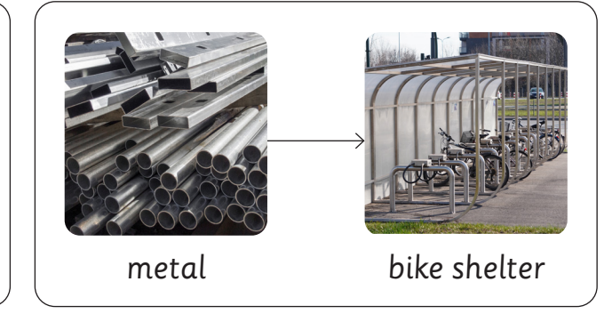
The frame of this bike shelter is made from metal.

Different materials have different properties. For example they can be strong, flexible, waterproof, transparent