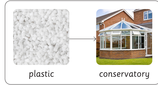
The frame of this conservatory is made from plastic.