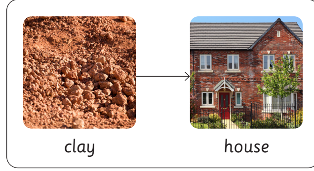
This house is made from clay bricks.