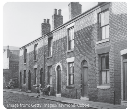
A street in the 1950s.

The way people use land changes over time. For example, in the 1950s there were fewer cars, so fewer roads were needed. Today lots of people have cars, so there are many more roads for people to drive on and driveways for parking.