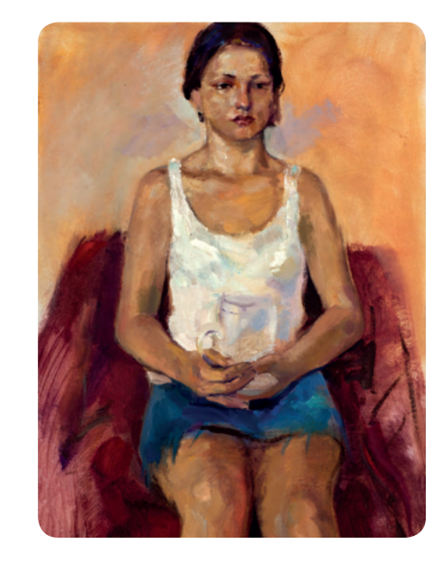
The textures of these two portraits are similar but the colours are different.

Portraits can be compared. The subject, colour, form, texture or composition of portraits can be similar or different.