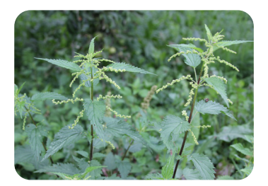
chemicals that are poisonous

Some plants provide a home to other animals that provides them with protection.