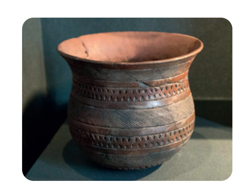
Bell Beaker pottery