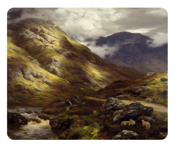
Wandering Shadows by Peter Graham, 1878

In this painting by Peter Graham, shades of green and orange are used to give the impression of wandering shadows.