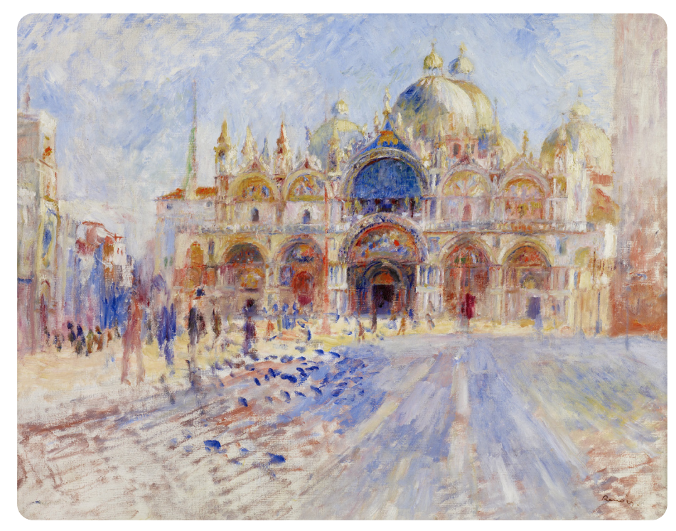
The Piazza San Marco by Pierre Auguste Renoir, 1881

In this painting by Pierre Auguste Renoir, a bright, soft colour palette is used with lots of tints to emphasise the effect of light.