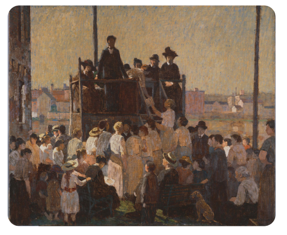
The Evangelist by Robert Spencer, 1919

In this painting by Robert Spencer, tones of blue, brown and orange are used to reflect the gritty reality of an industrial mill town.