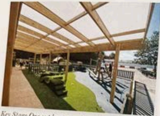
Key Stage One outdoor areas have been transformed

On 1st March 2024, Cranleigh Church of England Primary School became part of The Good Shepherd Trust (GST), a dynamic multi-academy trust that includes 24 schools across Surrey and Hampshire. With a mix of both Church of England and non-affiliated schools, GST's purpose is to create a thriving network where schools can collaborate, share resources, and work towards common values and goals. At the heart of this vision is the belief that "to be better, together" is the key to ensuring the success of every child in the trust's care.