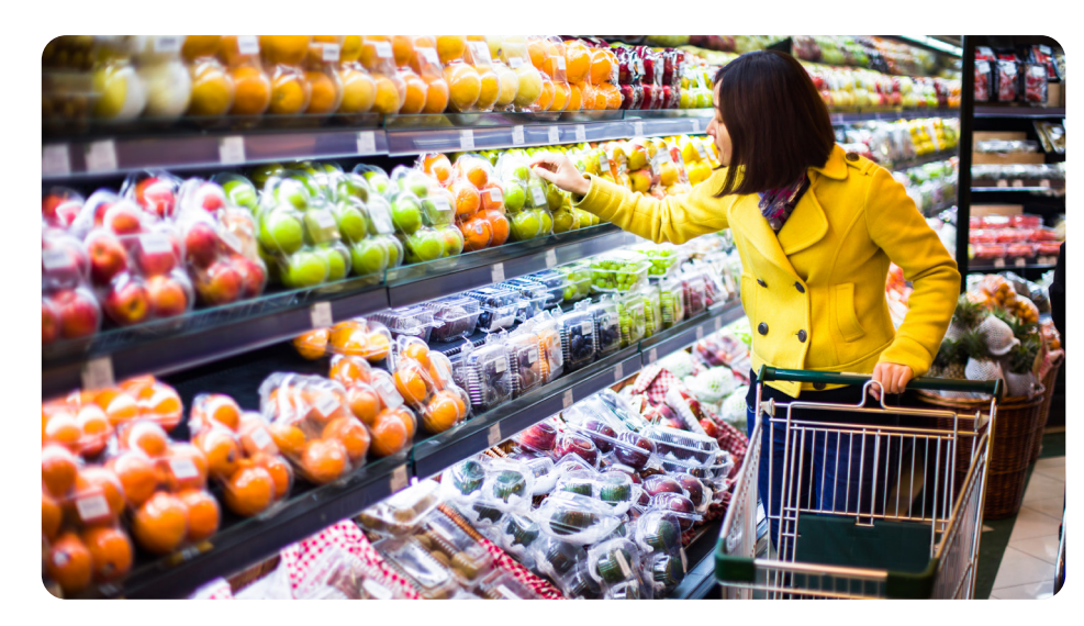
A shop is a place where people go to buy food, drink and other things with money.

Read these interesting facts about food and farming with a parent, carer or teacher.