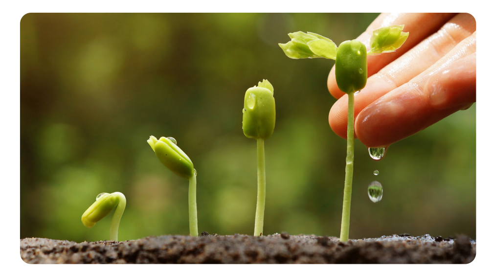
Many plants grow from seeds. Plants need water, sunlight, air and warmth to grow.