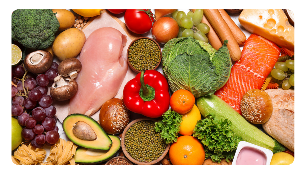
Food can be from plants or animals. Fruit and vegetables are from plants. Meat, milk and eggs are from animals.