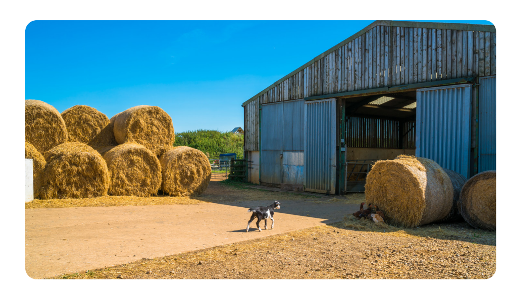
A farm is an area of land and its buildings used for growing plants and rearing animals. Farms make lots of the foods that we eat.