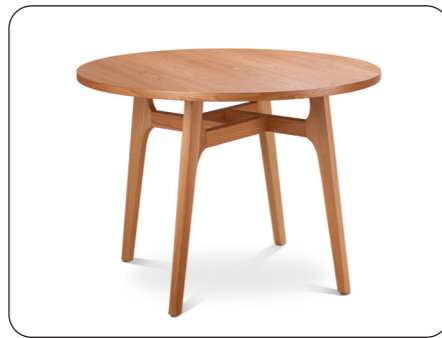
This table is made from wood.