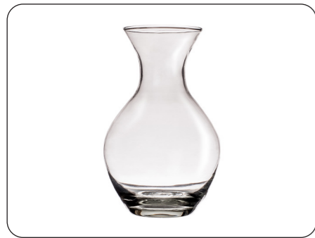
This vase is made from glass.

Materials are all around us, such as in the home, garden, school and park. They are important because we use materials to make the objects we use every day.