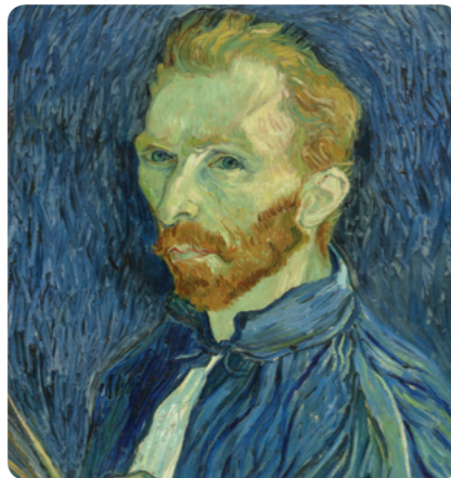
Self-portrait, Vincent van Gogh, 1889

A self-portrait is a portrait that an artist produces of themselves. Vincent van Gogh painted many self-portraits.