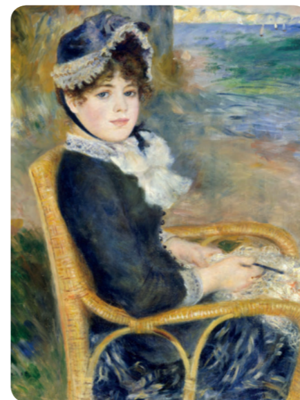
The textures of these two portraits are similar but the colours are different.