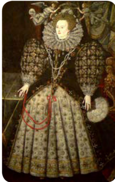
Portrait of Elizabeth I of England attributed to Nicholas Hilliard, 1590