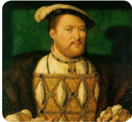
Portrait of Henry VIII by Joos van Cleve, c1530–1535

A portrait is a painting or photograph of a person. It usually shows their head and shoulders, but may show their whole body. Before cameras were invented, kings and queens often had official portraits painted to show how powerful and important they were.