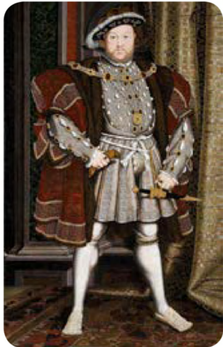
Henry VIII by Hans Holbein the Younger, 1537–47