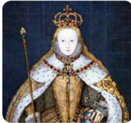
Coronation Portrait by unknown artist, c1600