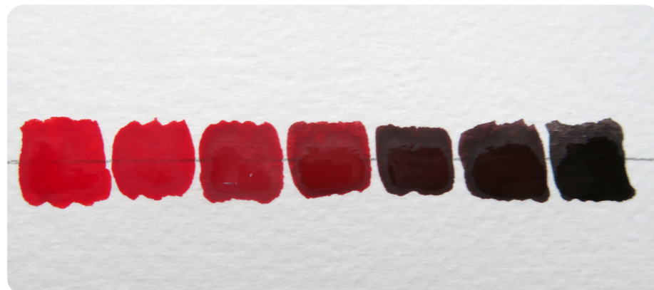
shades of red

A shade is a colour mixed with black. The more black paint that is added to the original colour, the darker the shade. A shade can range from slightly darker than the original colour to nearly black. When mixing a shade, begin with the pure colour and add black paint a tiny bit at a time.