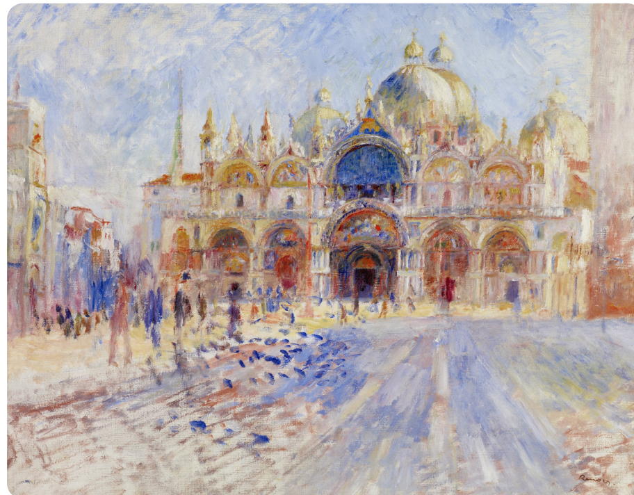
The Piazza San Marco by Pierre Auguste Renoir, 1881

In this painting by Pierre Auguste Renoir, a bright, soft colour palette is used with lots of tints to emphasise the effect of light.