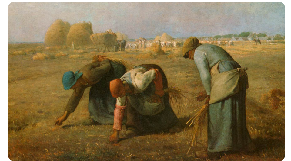
The Gleaners by Jean-François Millet, 1857

Realists use subtle tones and shades of natural colours. Their colour palette is largely browns, reds, black, greys and ivories.