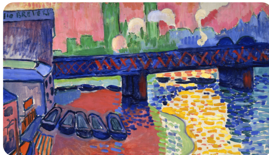
Charing Cross Bridge, London by André Derain, 1906

The Fauvists' colour palette consists of complementary colours to make their colours look brighter when used side by side. These non-naturalistic colours create an abstract style.