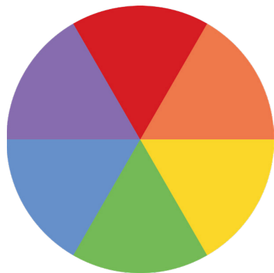
Primary and secondary colours