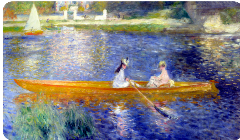
The Skiff (La Yole) by Pierre-Auguste Renoir, 1875

Impressionists use soft, pale colours with tints to capture the feeling of light in their paintings. Their artwork is more about capturing the impression of a moment in time rather than exact details.